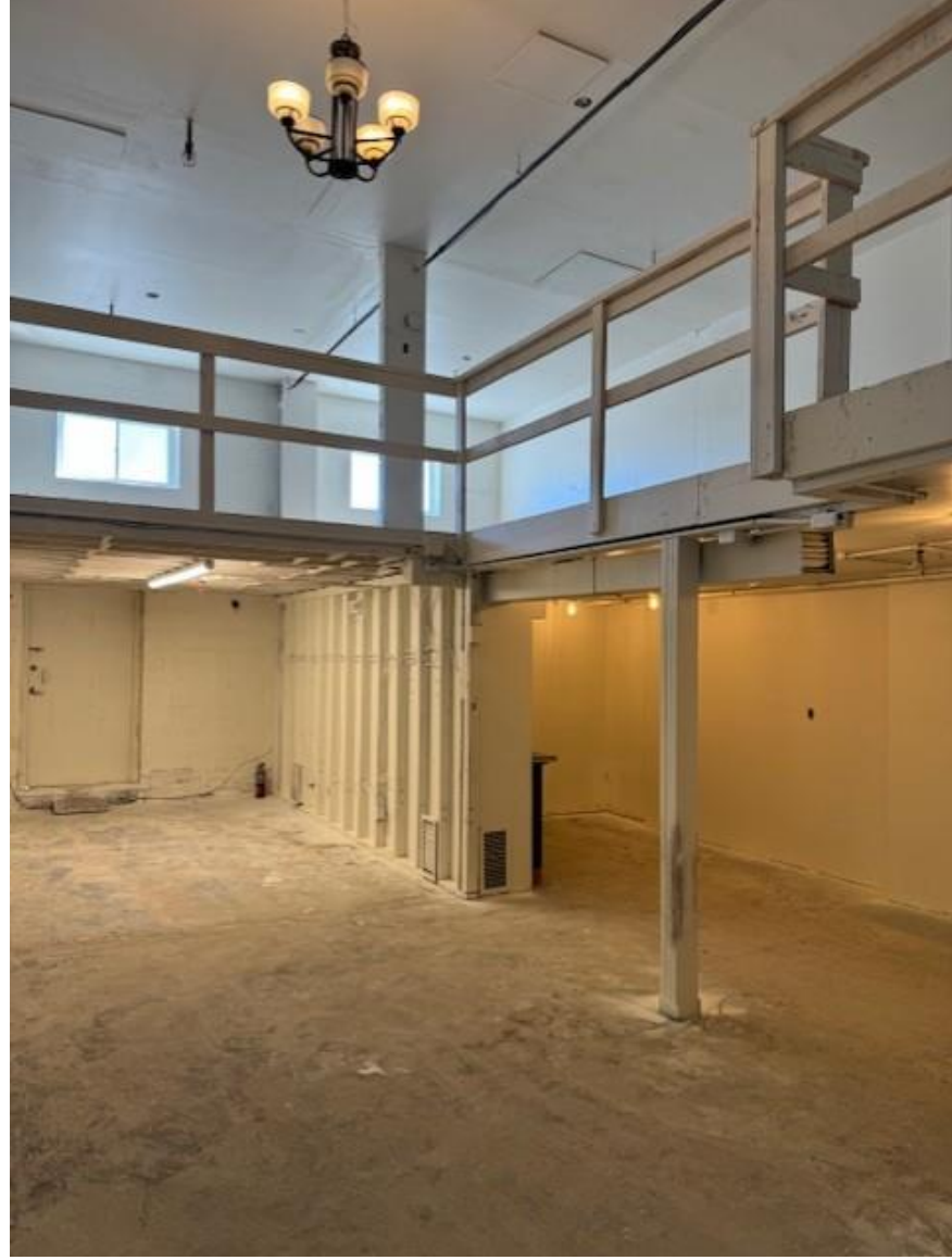
UNIT 114 28 INDUSTRIAL STREET