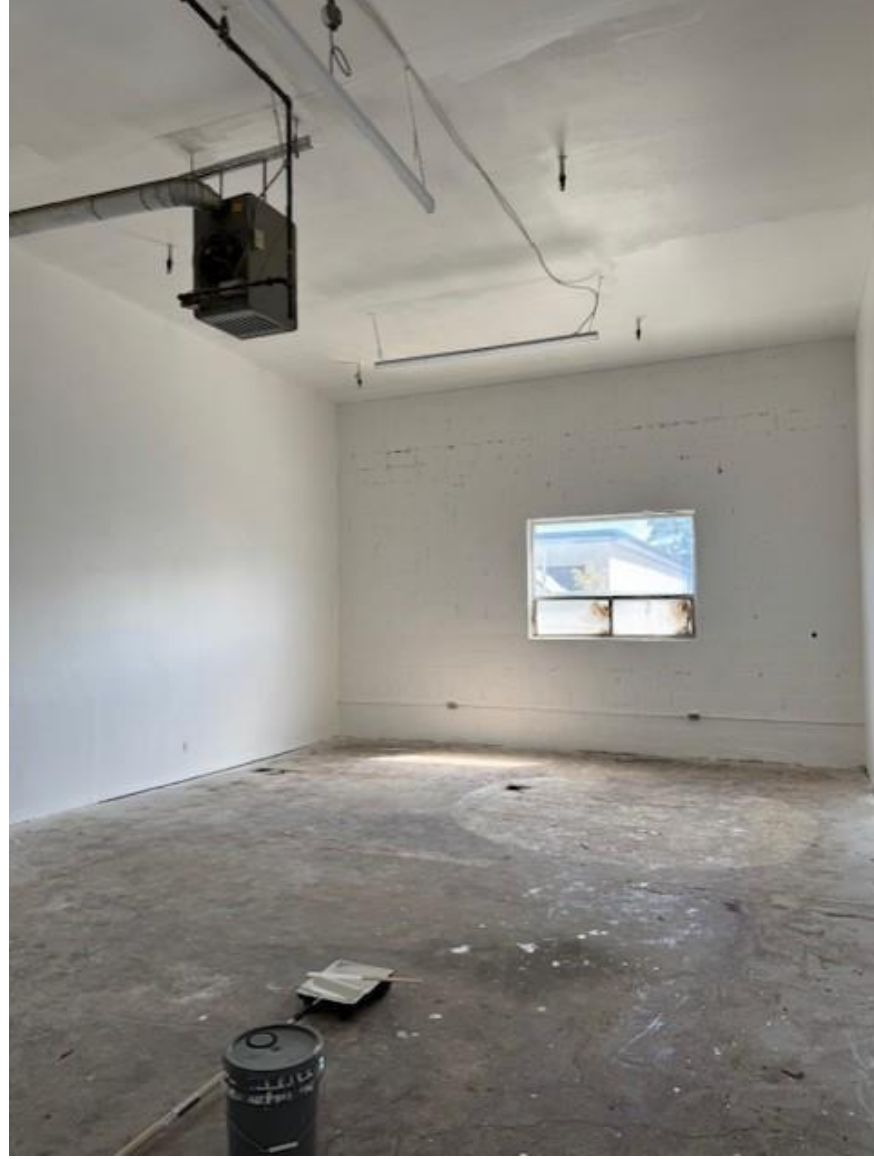
UNIT 112 28 INDUSTRIAL STREET