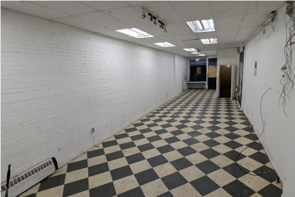
213A Queen St E